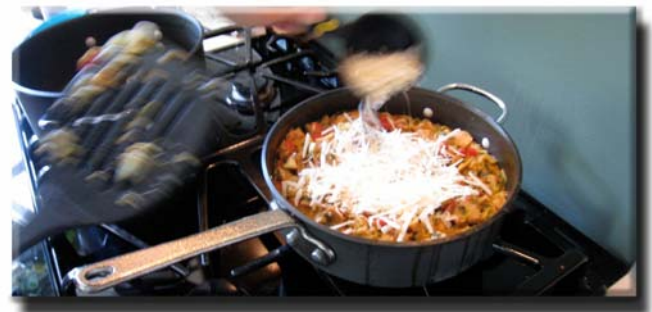
Lemony Artichoke Seitan Pasta