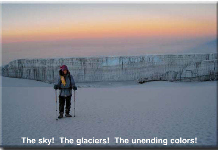
The sky! The glaciers! The unending colors!