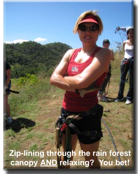
Zip-lining through the rain forest canopy AND relaxing? You bet!

dinner at Lava Lounge, volcano-watching after dark Saturday — breakfast and hiking at Observatory Lodge, depart back toward the coast, lunch at Cafe Macadamia, depart for USA